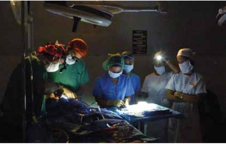
Torchlight surgery during a power blackout in Cebu

problems emerge and the child may need speech therapy and orthodontic management.