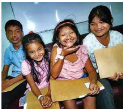
Four young patients wait their turn.

"Cleft" children often bullied Filipino children, just like Australian children, can be very cruel and bully their peers at school, and a "cleft child" is frequently subjected to this early childhood abuse. We pride ourselves with a unique model of returning to the same site annually, following our children and doing secondary procedures as needed. As children grow, other