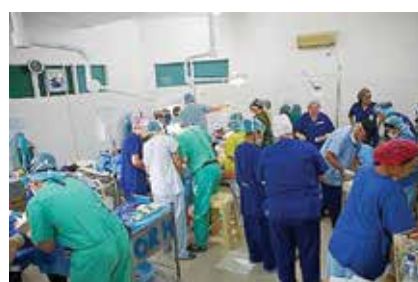
Four operating tables hard at work!