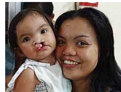
Former patient mother with daughter

What this has meant is that the people of this district have had a place to turn to not only for cleft lip and palate surgery but for general medical care as this has made the hospital more self sufficient.