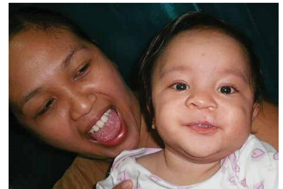
The end result: a dramatic improvement in appearance and function.

as the infant grows to bring the structures of the mouth into a more