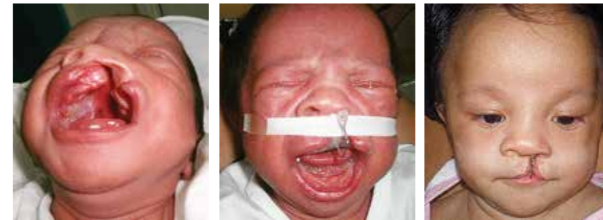
Infant at birth with wide cleft and the same infant fitted with a "NAM" bringing the tissues into a more 'normal' position making surgical repair possible.

The Naso-Aveolar Moulding (NAM) project has continued for children born with very wide clefts who could not be properly treated in a mission environment and without orthodontic intervention.