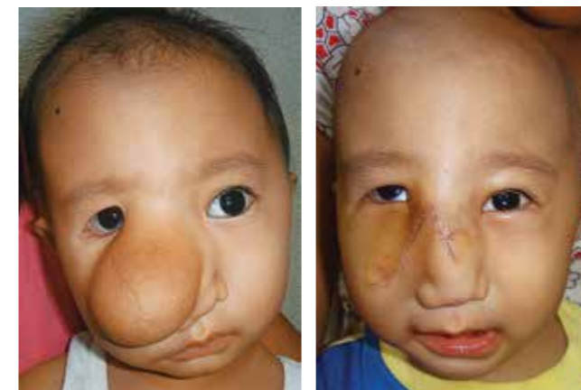
Before and after initial repair of encephalocele

As in years past, encephaloceles (protrusions of the brain tissue through the frontal area of the skull) which are quite rare in developed countries