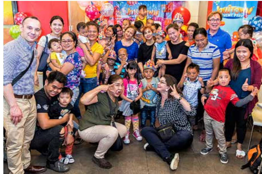
Screening for Children with Severe Birth Defects and Deformities