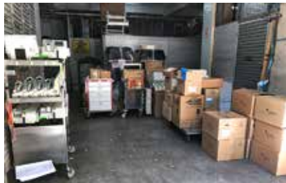
Donated equipment shipped to the Philippines

In the past few years we have shipped hospital beds to a remote island hospital where our partners were holding missions, anaesthetic machines to burns and cleft units, donated medical supplies and now personal protective equipment (PPE) to hopefully help keep our volunteers, partners and colleagues safe during the COVID-19 pandemic.