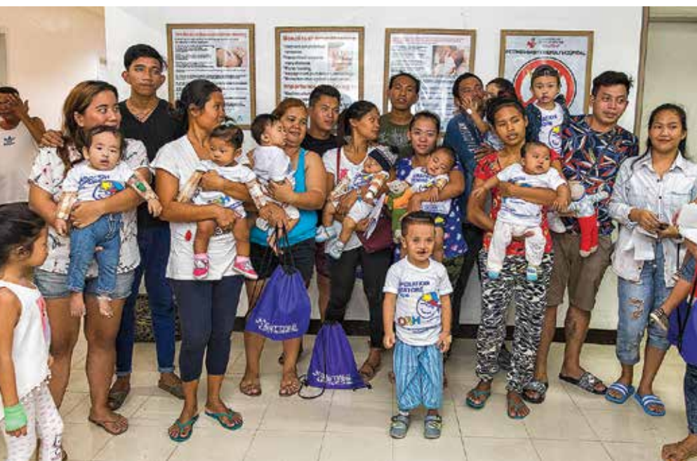
Busy day on the wards during Mission 2019

Operation Restore Hope Australia's annual mission for 2019 took place at the end of June 2019 subsequent to last year's newsletter. The mission was a success with 42 patients receiving surgical and dental treatment. We have had a 98% patient return rate at our follow-up clinics.