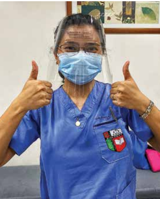
ORHA sent personal protective equipment (PPE) to help during the COVID-19 pandemic.

We pray that the lives of those less fortunate in the Philippines will soon improve and the pandemic will ease so that we may fully continue the work of Operation Restore Hope Australia.