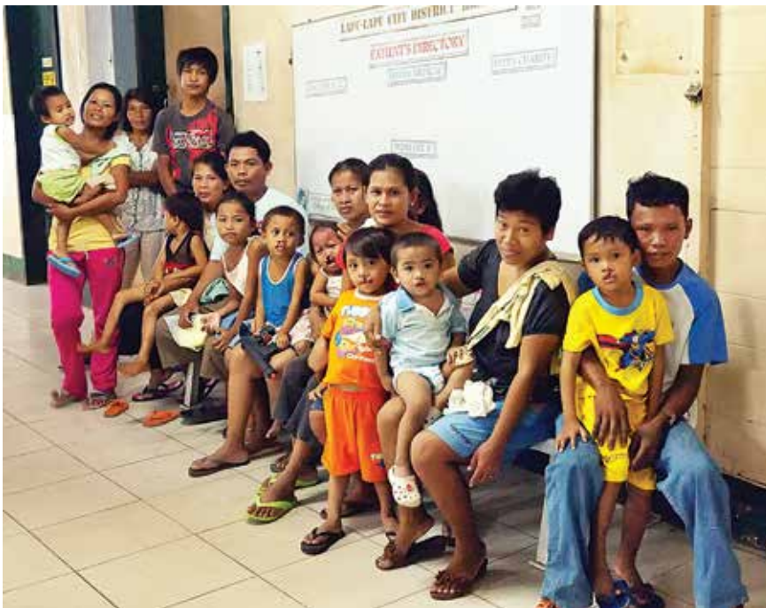
The morning line-up.

Operation Restore Hope provided 200 cleft lip and palate operations over three missions to Cebu and Manila in 2010 continuing our long term community commitments to Lapu Lapu Hospital in Mactan in Cebu and the PDMMMC Hospital in Caloocan in Manila.