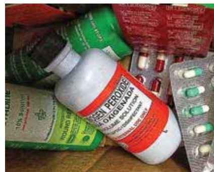
Medicines for typhoon relief

So much infrastructure was heavily damaged in the earthquake including the H W Miller hospital where the February mission was scheduled to be held that