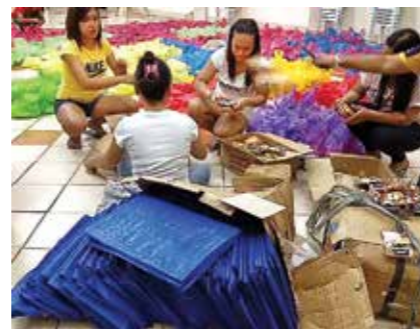
Packing tarpaulins for typhoon relief

consecutive year in the southern province of Batangas in Luzon just two hours south of Manila. The mission was moved last year as this is a high area of need that was not being serviced by other missions.