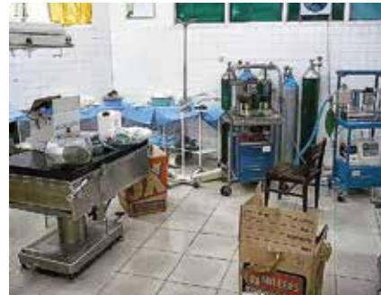
Medical equipment for typhoon relief

Last year was our 20th year of operating in the Philippines, having commenced in Cebu in 1994, but sadly it was disrupted by two back-to-back tragic natural disasters: a 7.2 magnitude earthquake hit Cebu on 15 October 2013 only to be followed on 8 November 2013 by the deadliest typhoon on record in the country. It was known as Haiyan in Australia but as Typhoon Yolanda in the Philippines.