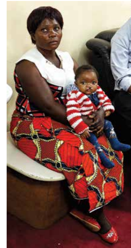
Infant patient with a unilateral cleft lip and his mother at the clinic in Zambia