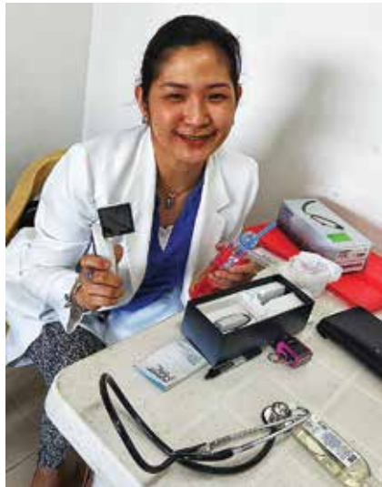
We recently donated a video laryngoscope to the Philippine Children's Medical Center in Manila

Operation Restore Hope recognises that more often than not the barriers to surgeons and allied health professionals in developing countries carrying out surgery for less fortunate people is more limited by a lack of infrastructure, equipment and funds than talent or will to help.