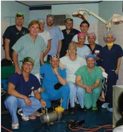
Team of Volunteers in one of the theatres at Paraque Hospital Right: Happy to be included in pre-mission patient screening

A few months ago in November, 140 children received an early Christmas present, the ability to smile and be smiled back at from Operation Restore Hope! Three teams operated over a two week period to make this miracle possible.