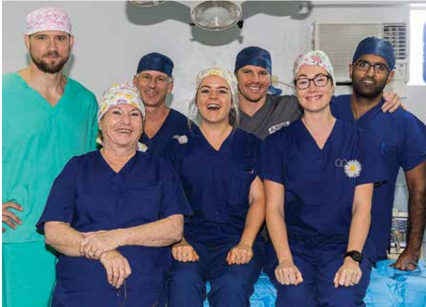
Part of the team in the theatres

We had the most amazing team of volunteers this past mission travel from Australia and the UK.