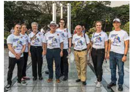
Operation Restore Hope at the Tomb of the Unknown Soldier in Manila for ANZAC Day Dawn Service