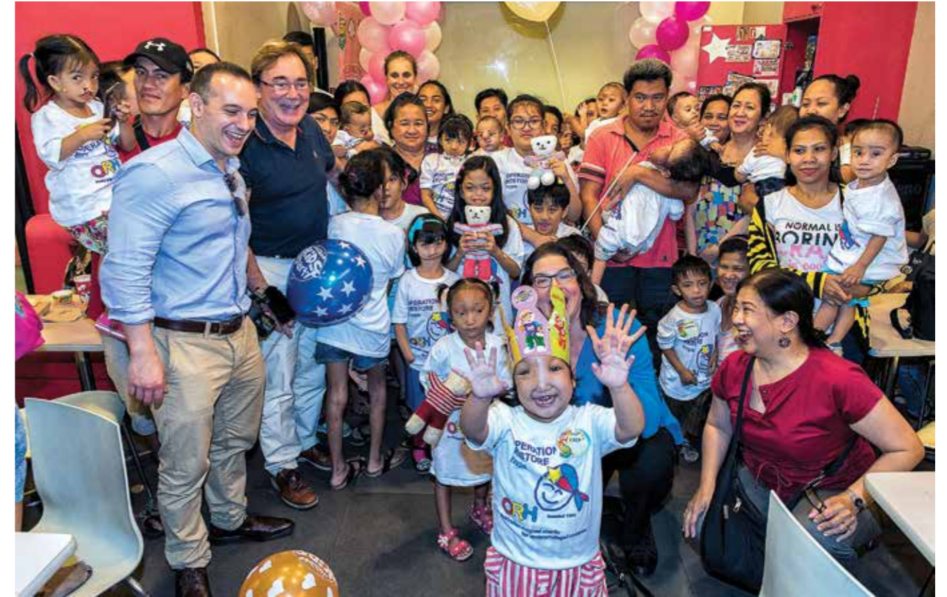
Patient screening for the Philippine Children's Medical Center (PCMC)

Our work extends to financing the most difficult of cases not possible to be carried out by surgical missions such as ours.