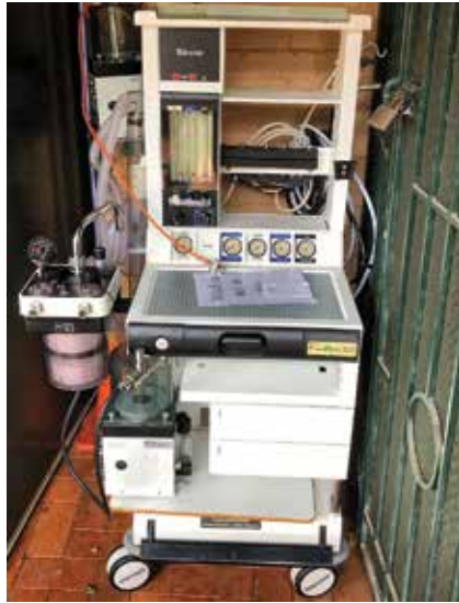
ORHA sent medical equipment to help during the COVID-19 pandemic.