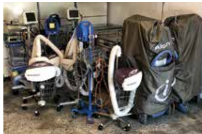
Some equipment making its way to the Philippines for use in charity surgery

This program not only keeps these supplies and equipment out of Australian landfill but puts them to use in areas of