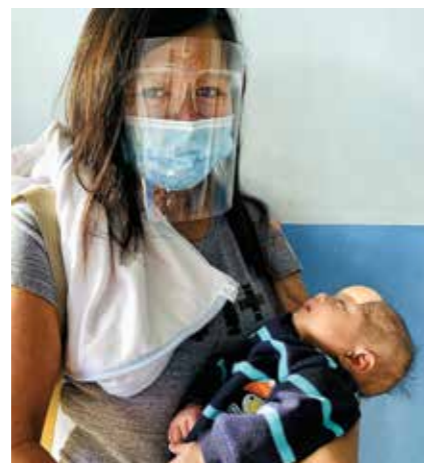
PPE for caregivers

Logistically, ORHA like the rest of the world, has had to find ways to enhance communications. We have been “Zooming” and have begun to move all records to cloud based systems so that we can better share resources and data-bases real time. This has become more involved as previously surgery would be postponed due to fever or infection but now, patients are testing positive to COVID pre-operatively and being rescheduled until such time as both they and their parent or caregiver can return a negative test.