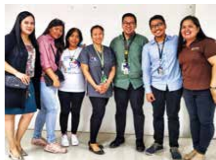
A few of our Filipino volunteers running our mission screenings and pre and post-operative clinics

ORHA has not been able to hold a mission in 2020-2021 due to travel restrictions. This situation has been made worse by lockdowns in the Philippines and that cleft surgery is not classed as life threatening surgery. Plans were made for our Filipino ORHA volunteer plastic surgeons to carry out surgery on ORHA mission patients